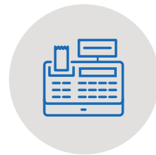
Countertop retail merchants