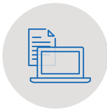
Services and back-office billing merchants